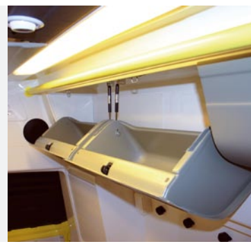
Practical, comfortable work environment.